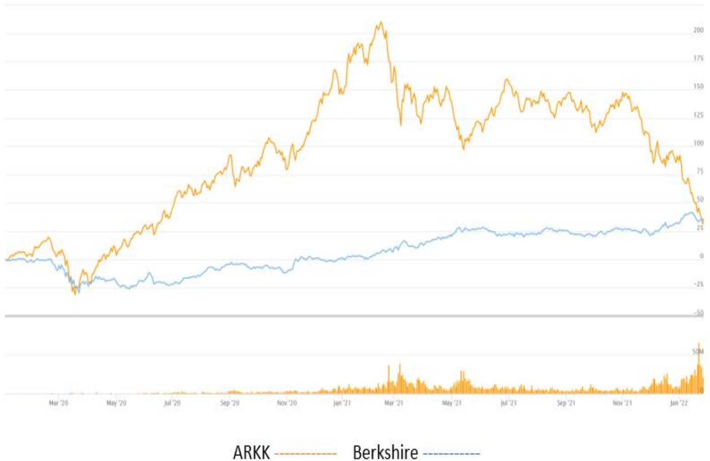
Figure 1 ARK Innovation ETF vs Berkshire Hathaway Share Price Performance

Locally, we have had a similar experience with SA Equity Funds. After being deeply out of favour for the better part of five years, there is renewed interest in local equities. Suspiciously, the interest in going overweight SA is only after the JSE All Share Index has doubled in two years. With the local economy and the fiscus looking in worse shape now than before the pandemic began, we would look both ways, twice, before crossing this street. Any allocation decision should be based on our expectations of the future and not what we see in the rearview mirror.